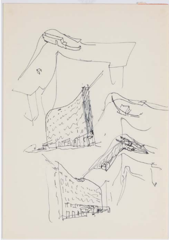
Álvaro Siza Vieira 1980 – 1983 Sketches for the corner building Schlesische Strasse / Falckensteinstrasse 1980–1983 Pencil on paper 29.7 x 21 cm

© Alvaro Siza Vieira Deutsches Architekturmuseum, Frankfurt am Main